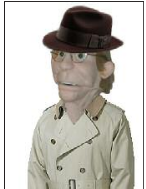
Dirk Steele is a professional puppet detective in South Florida and is frequently called in to assist puppet police nationwide.