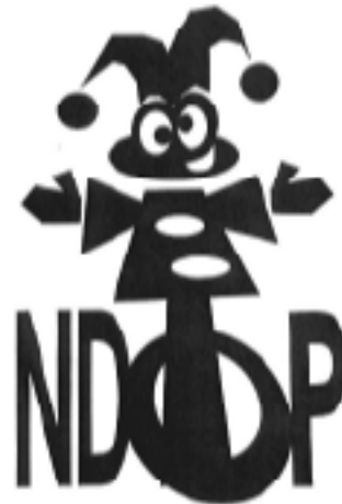
NDOP logo © 2000, Kevin Hedgpeth

the rest of the kids and parents construct paper finger puppets, paper lunch bag marionettes and a jointed frog shadow puppet. All the girls were able to earn their Try It badge by seeing the puppet show and making all three different kinds of puppets! After the puppets were completed there were two stages, set up by the guild, where the new puppets could give their first performances.